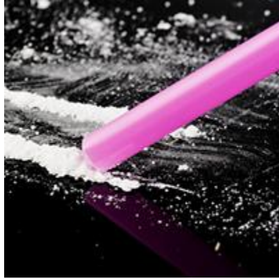
STRAW OR TUBE